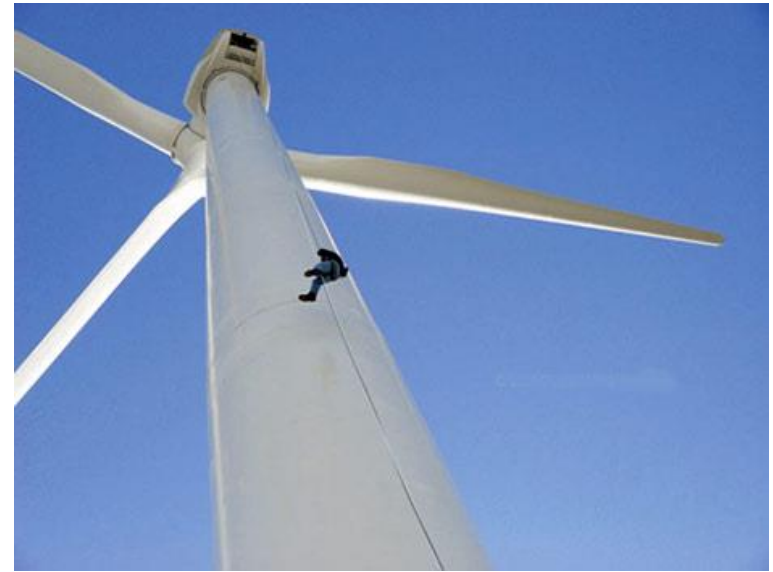
Clipper Liberty 2.5 MW Wind Turbine