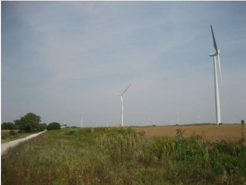
Invenergy's Grand Ridge Wind Farm, Marseilles, IN

Install a GE 1.5 MW turbine in the U.S. focusing the university's power electronics expertise on advanced reactive power turbine technologies and integration of wind into the electric power grid.