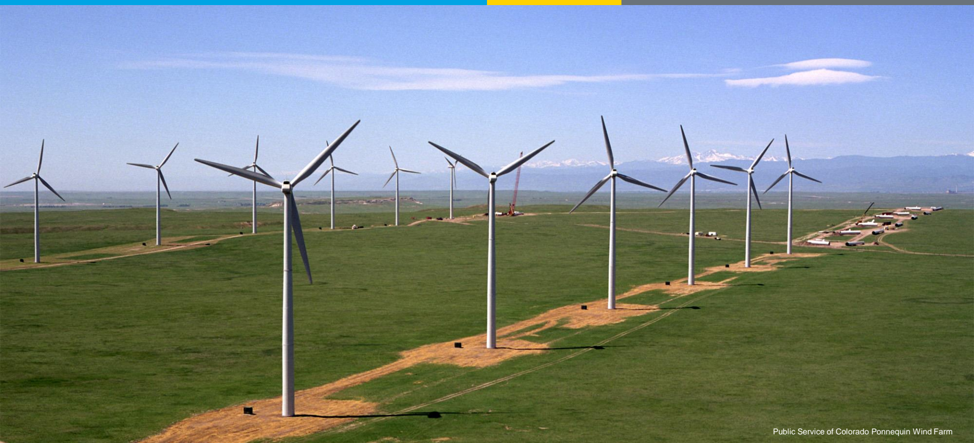
Public Service of Colorado Ponnequin Wind Farm