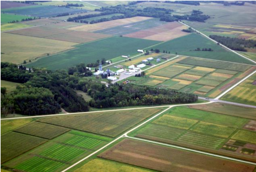
UMore Park, NW - looking south