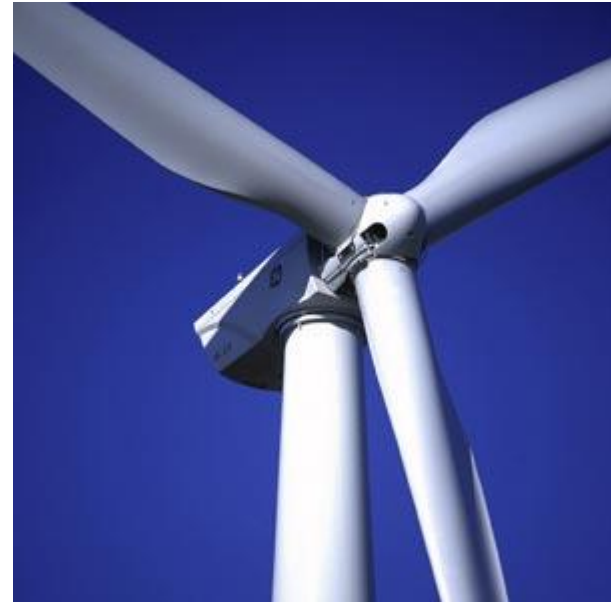
GE 1.5 MW turbine